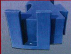
Modular Polyethylene Tank Stand