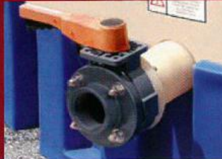
Patented FDO Outlet